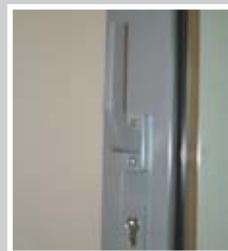
Lever handle with key lock below