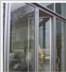
System SF70 tilt and turn panel within folding sliding doors