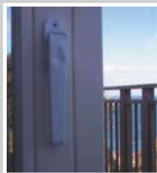
Flush door handle